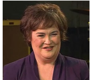
Susan Boyle sporting her brand new make-over talks to Meredith Vieira on NBC Today in July.

The weather did its best to be suitably "British", providing a spectacular lightning storm across London; which gave real drama to the story of one woman's rise to fame.