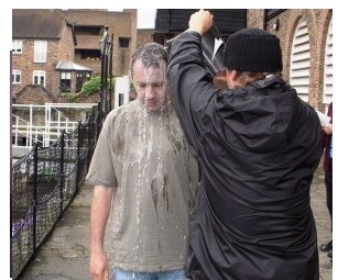
One of the actors in full make up prepares for his starring role as a drowning drunk

nominated for the auspicious Police Federation Bravery Award. The film was broadcast on The Sun website for two months, and readers were able to vote for the winners, the officers were awarded regional bravery medals . We don't recommend that anyone jumps into the Docks here where the water can be as much as fifteen ft deep - all of the water action took place in a film stunts tank!