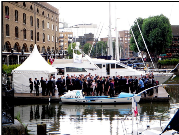
The tiny rowing boat, seen here will travel 2951 miles!

This enormous challenge, which is to raise money for East Anglia Children's Hospices and the MS Society sets off on December 6th.