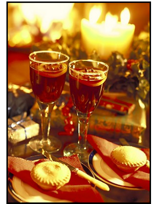
Mince Pies and Mulled Wine at the Christmas Carol Concert, Friday 11th December, 1pm.

This year, the Carol Concert is in aid of The Alzheimer's Society. Representatives will be on site to offer advice and information about the organization, and to help raise money from any donations you are able to give at this time.