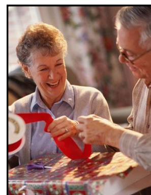
Please help to sponsor this year's St. Katharine Docks Senior Citizen's Christmas Party