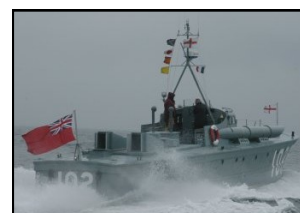
The amazing 70 year old motor torpedo boat, the MTB 102—the fastest vessel of the Royal Navy

They invited some guests aboard the Sunseeker to celebrate their arrival at St. Katharine Docks.